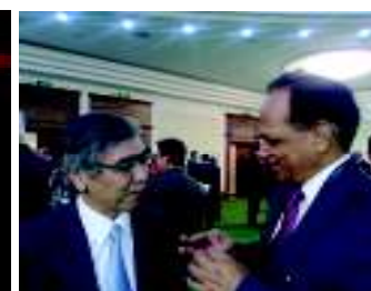
Our Chairman with Dr. Haruhiko Kuroda, President, Asian Dev. Bank (ADB)