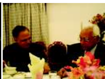
Our Chairman with Dr. AR Kidwai, the then Governor of Haryana & Delhi