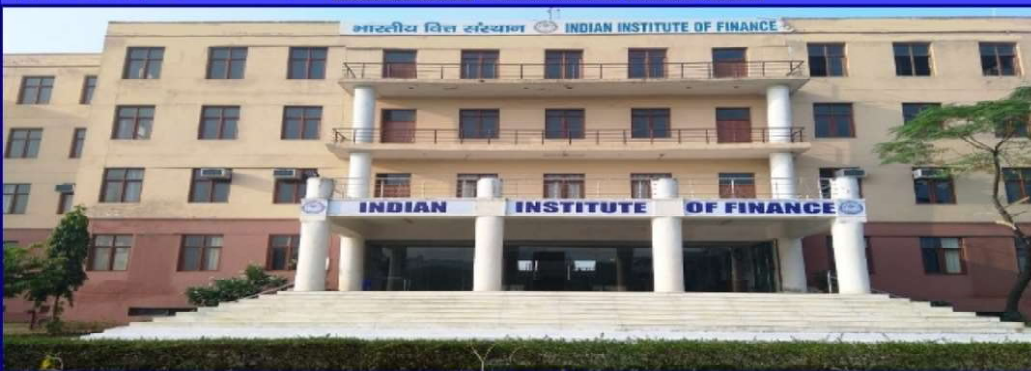
Snapshot taken on February 2nd, 2021