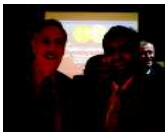
Our VC with Prof. Peter A. Diamond, (Nobel Laureate), MIT, USA